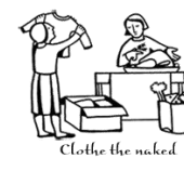
Clothe the naked