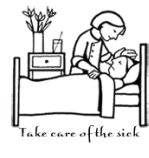
Take care of the sick